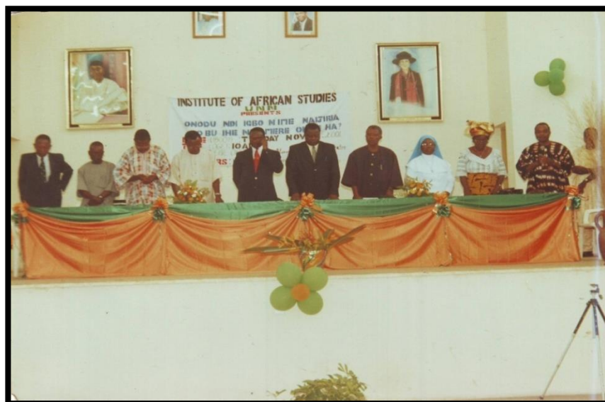
Participants at the programme titled, “Onodu Ndigbo Nime Nigeria Obu Ihe ha Mere Onwe Ha?” (The Condition of the Igbo in Nigeria, is it self-inflicted?).