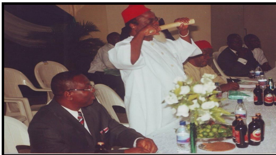
Former governor of Anambra State, Chief Chukwuemeka Ezeife (standing), during one of the International Conferences of the Institute of African Studies in 2008